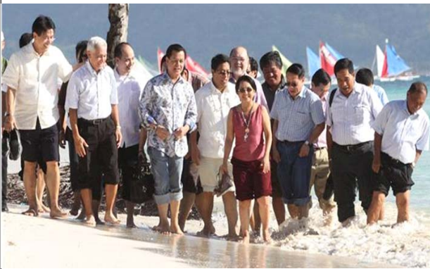
BAREFOOT EXECS. President Arryo, Vice-President Noli de Castro and members of the cabinet, walk barefoot on the beach of Boracay. The President made a call to visit the country's tourist spots to boost tourism this summer months.