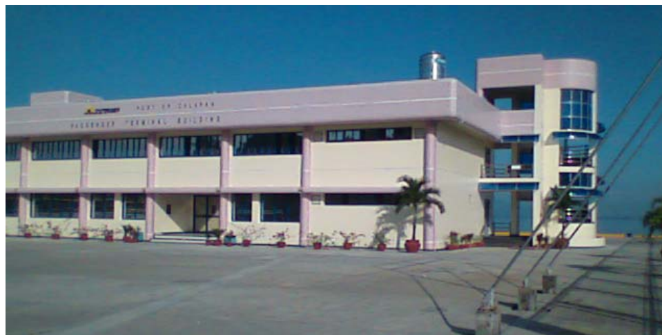
AFTER several inaugurations, the Calapan Port Terminal building finally opens charging each passengers P20 for a brief passage.