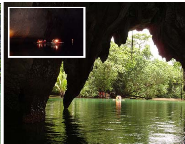
NATURE'S WONDER OF THE WORLD. The St. Paul Underground River in Palawan, also known as the Puerto Princesa Subterranean River National Park, earlier declared as Unesco World Heritage site, has made it to the second round of voting for the New 7 Wonders of Nature. Photos show boats carrying tourist entering the mouth of the river. (Inset) It's dark and pungent inside. Story on Page 3.