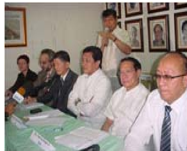
HOG DISEASE PROBE. A joint international and local panel is investigating the presence of Ebola virus in some big hog farms in Luzon.

However, Mr. Bioco said "the government should encourage the private sector [to put up corn facilities] by exempting equipment from the value-added tax (VAT)."