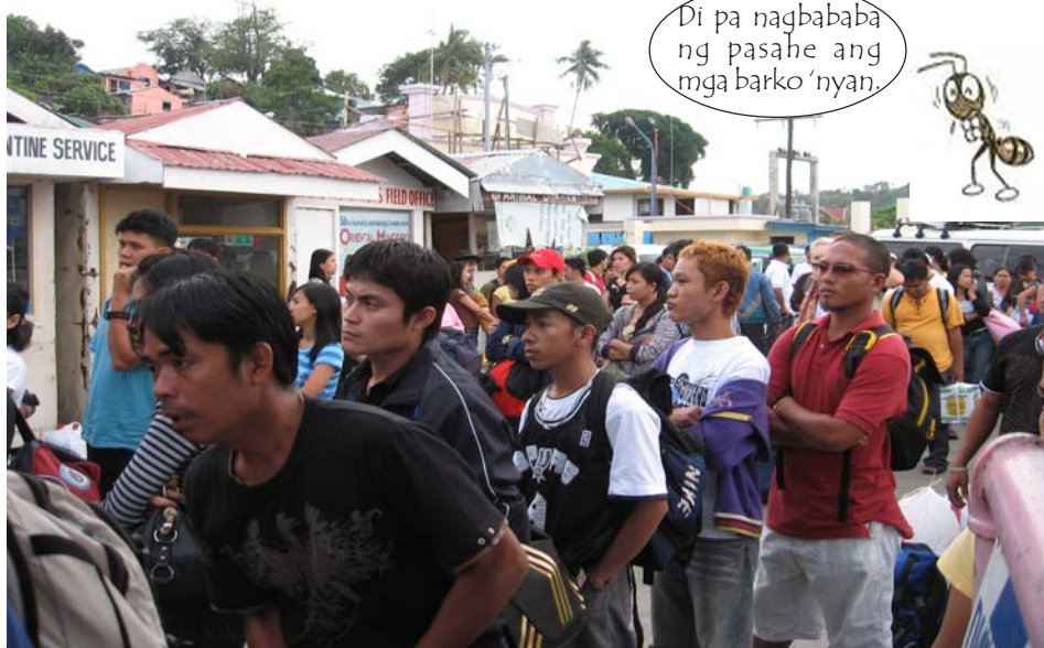
GALING SA BAKASYON. Nagmistulang pila sa isang movie box-office hit or concert ng isang sikat na singer ang Philippine Ports Authority Compound sa Calapan City Pier, Oriental Mindoro nang dumagsa noong Linggo, January 4 ang mga pasaherong karamihan ay nanggaling pa sa Iloilo at Aklan via the Strong Republic Nautical Highway pabalik sa Metro Manila.