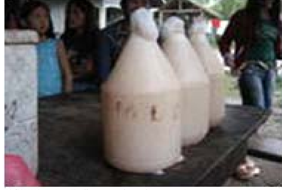
TAGAY NA. Tatlong "bol" ng manamis-namis at sumusubo pang tuba ang nakahanda na para sa mga parokyano ng isang kantina sa Barangay Malaya, Pinamalayan, Oriental Mindoro. Kadalasang pulutan sa ganitong inumin sa barrio ay adobong dalag o inihaw na tilapia.

The third series of the semifinal rounds will be played on January 30 with Mindoro Tamaraw going against Natsco and Rumaillah Group versus One Family of which the results would be crucial