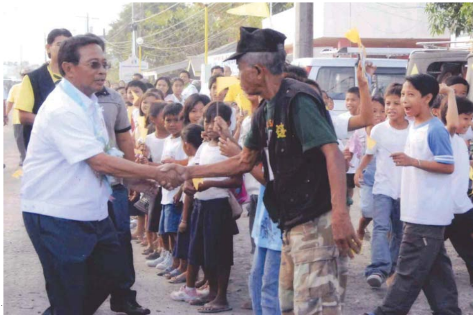
WELCOME TO MINDORO. An elderly barangay tanod welcomes United Opposition and Makati Mayor Jejomar C. Binay during the latter's recent visit to Occidental Mindoro. The opposition stalwart has been invited by the provincial government and school officials to talk on his program for education. Under Binay's leadership, the city provides free uniforms, school supplies and textbooks to primary and secondary public school students and heavily subsidized tertiary education at the city-owned University of Makati.