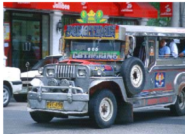
MULTICABS and jeepneys are the means of transport for short distance rides in Mimaropa provinces.